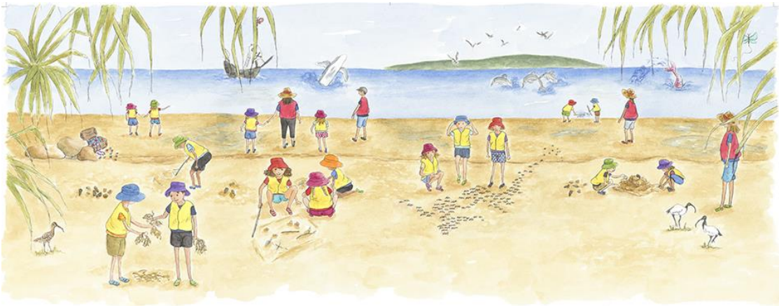
The Magic of Wynnum General Gordon's Beach Kindy

To provide educational and cultural experiences which extend children's knowledge and understanding of the wider community, excursions maybe planned under careful supervision and with parental permission. We are excited to offer 'Beach Kindy', visiting Pandanus Beach regularly throughout the year; and 'Wynnum Walkabout', visiting the local library, café's etc. as part of our curriculum. These visits provide great opportunity for play, discovery and active learning in our beautiful community, right on our doorstep. Annual permission forms for these excursions are included in your Enrolment Package.